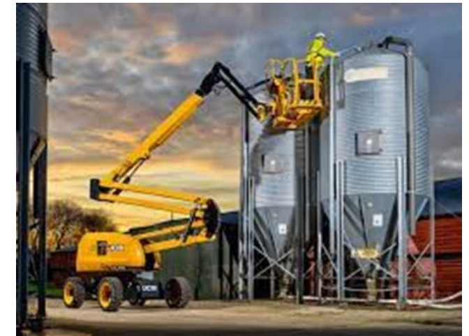
Aerial Work Platform