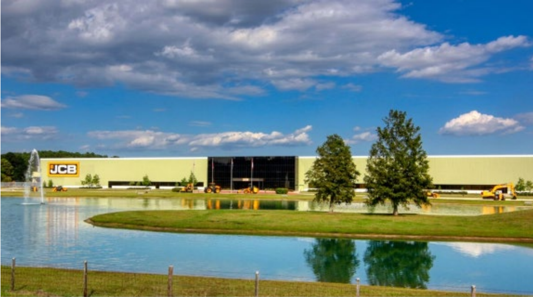
JCB North America – Pooler, Georgia