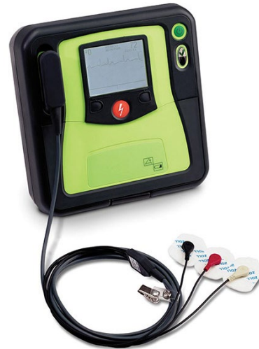
Zoll AED Pro 3 Lead Defibrillator