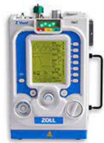
Zoll Portable Ventilator