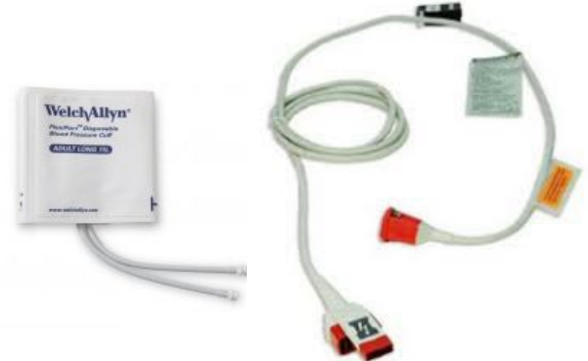
Blood Pressure Cuff