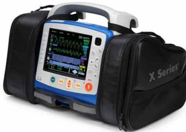
Zoll X-Series 12 Lead Defibrillator

Zoll Equipment contract approved by City Council on November 2, 2023