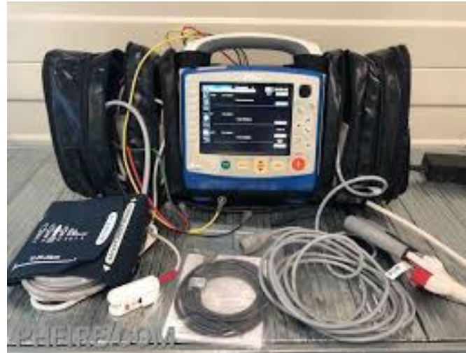
Monitors/Defibrillator Unit (with accessories)