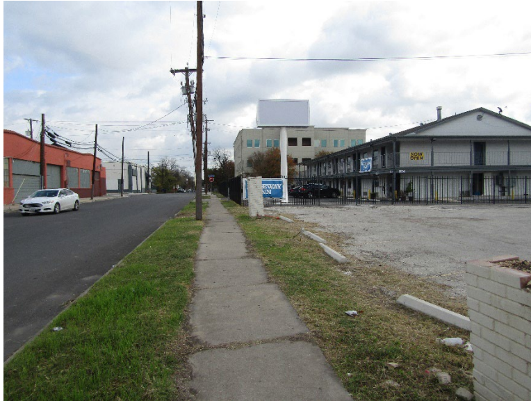
Location of Proposed Fence