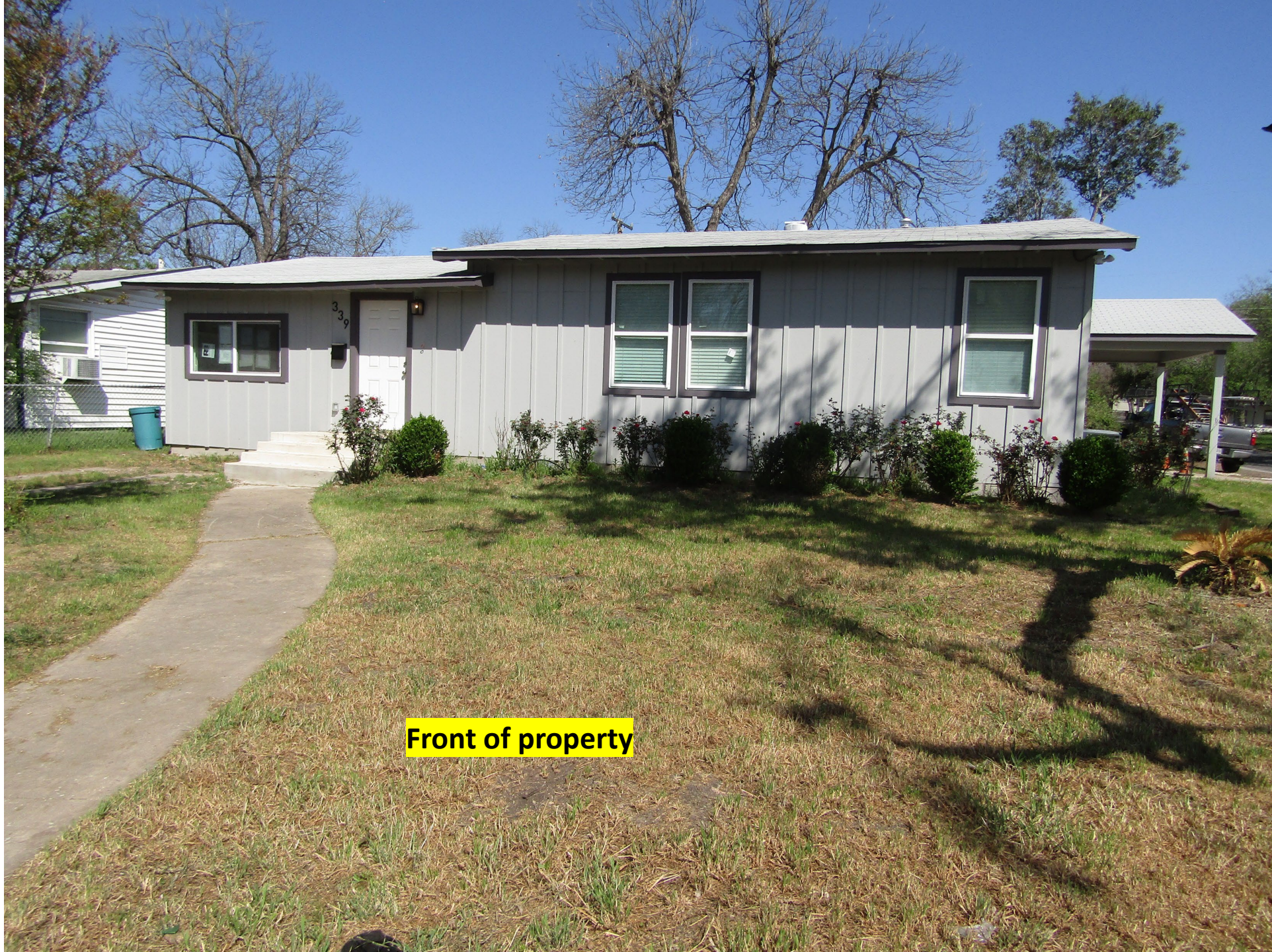
Front of property