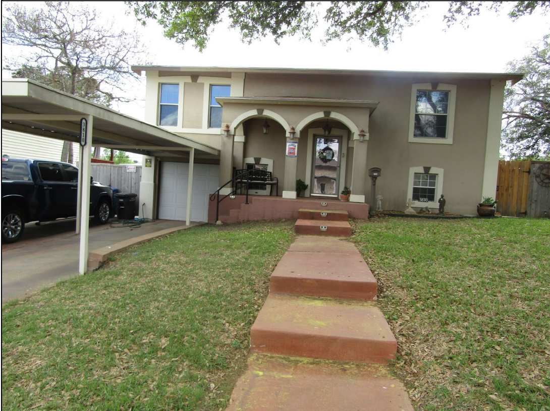
Views of subject property