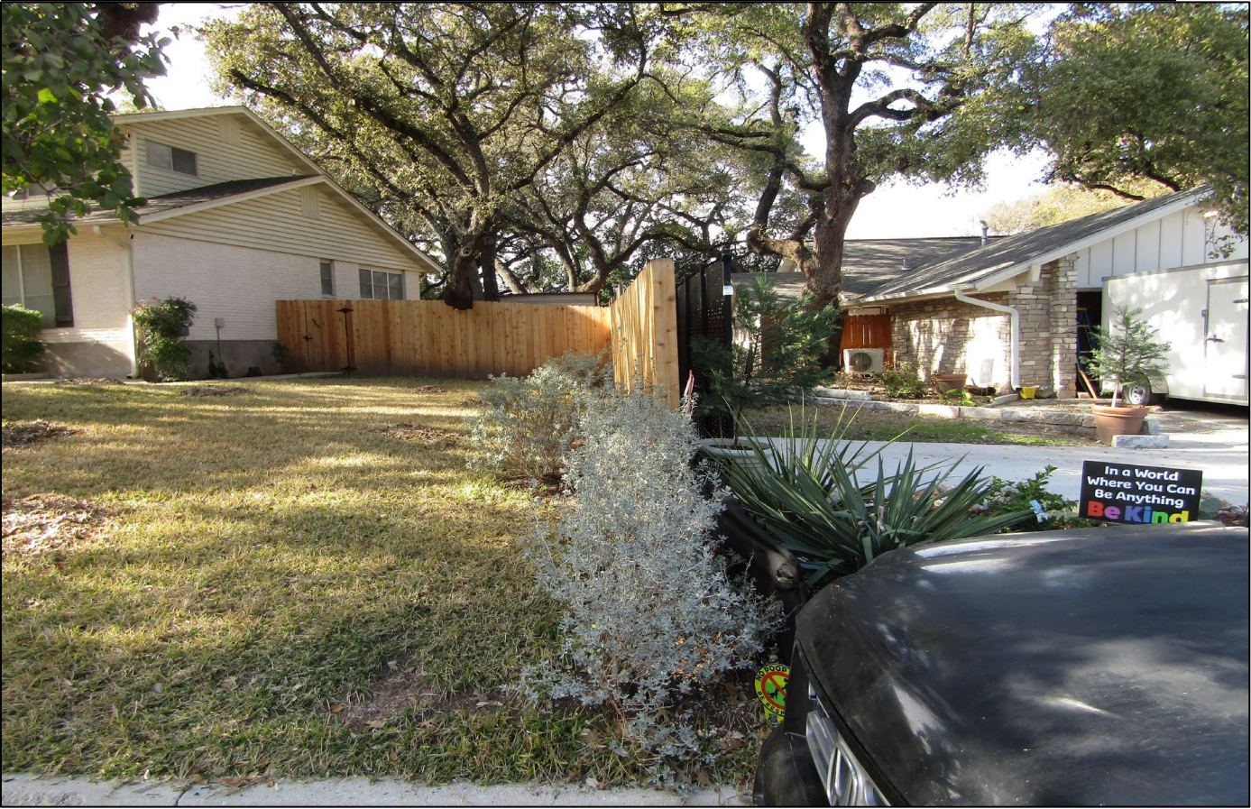
Views of subject property and neighboring fence