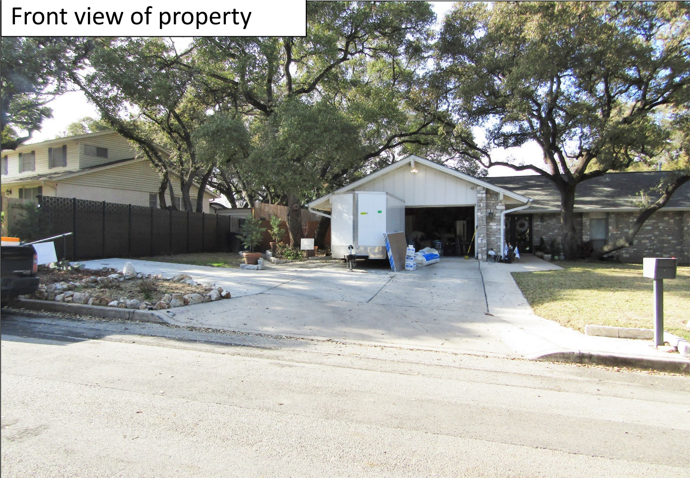
Front view of property