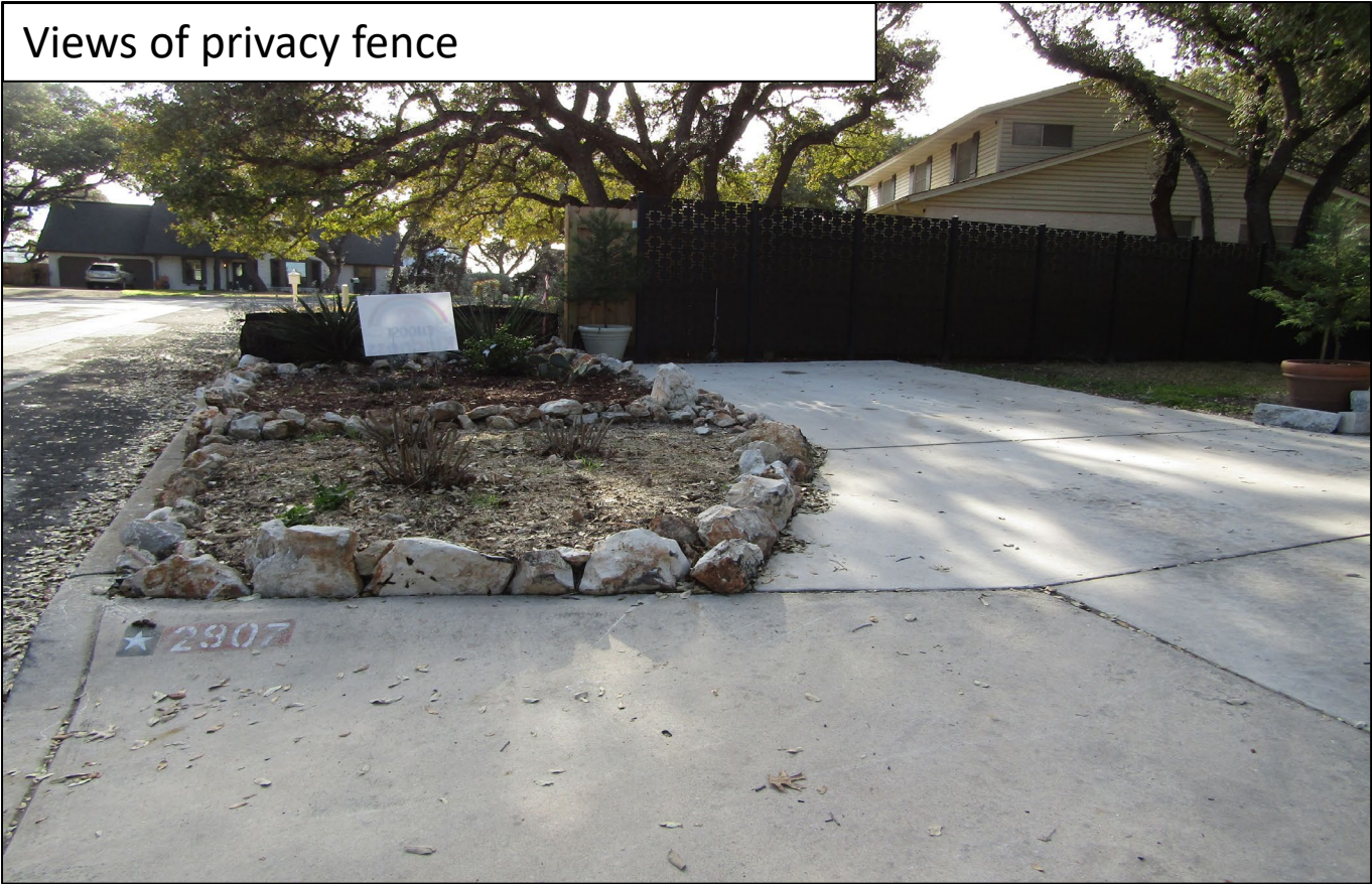
Views of privacy fence