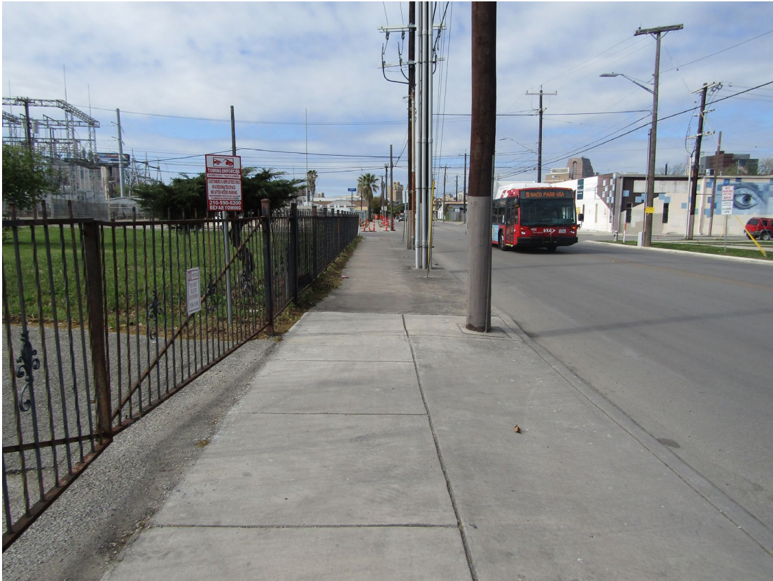
North Alamo St facing North