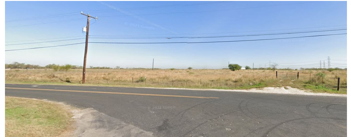
Ground View of Applicant Property