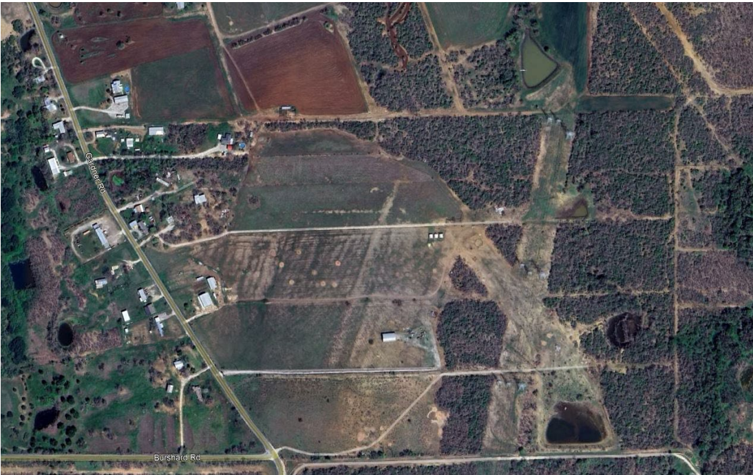
Aerial View of Applicant & Adjacent Property