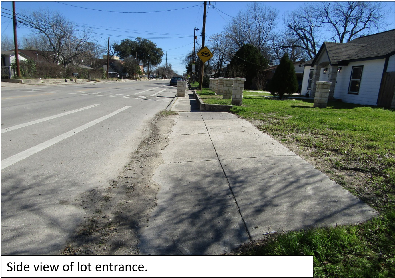
Side view of lot entrance.