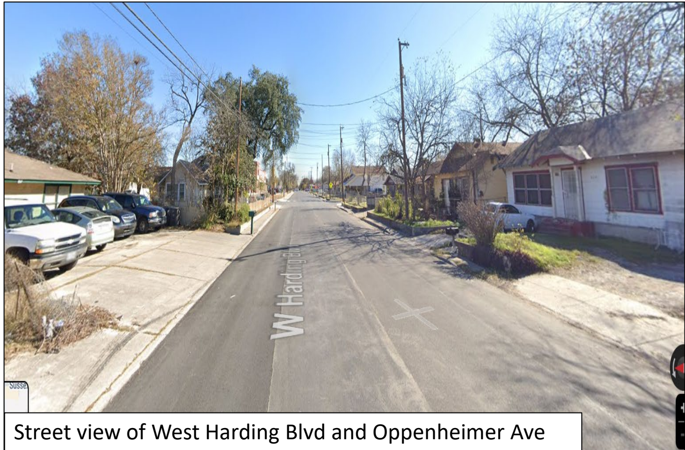
Street view of West Harding Blvd and Oppenheimer Ave