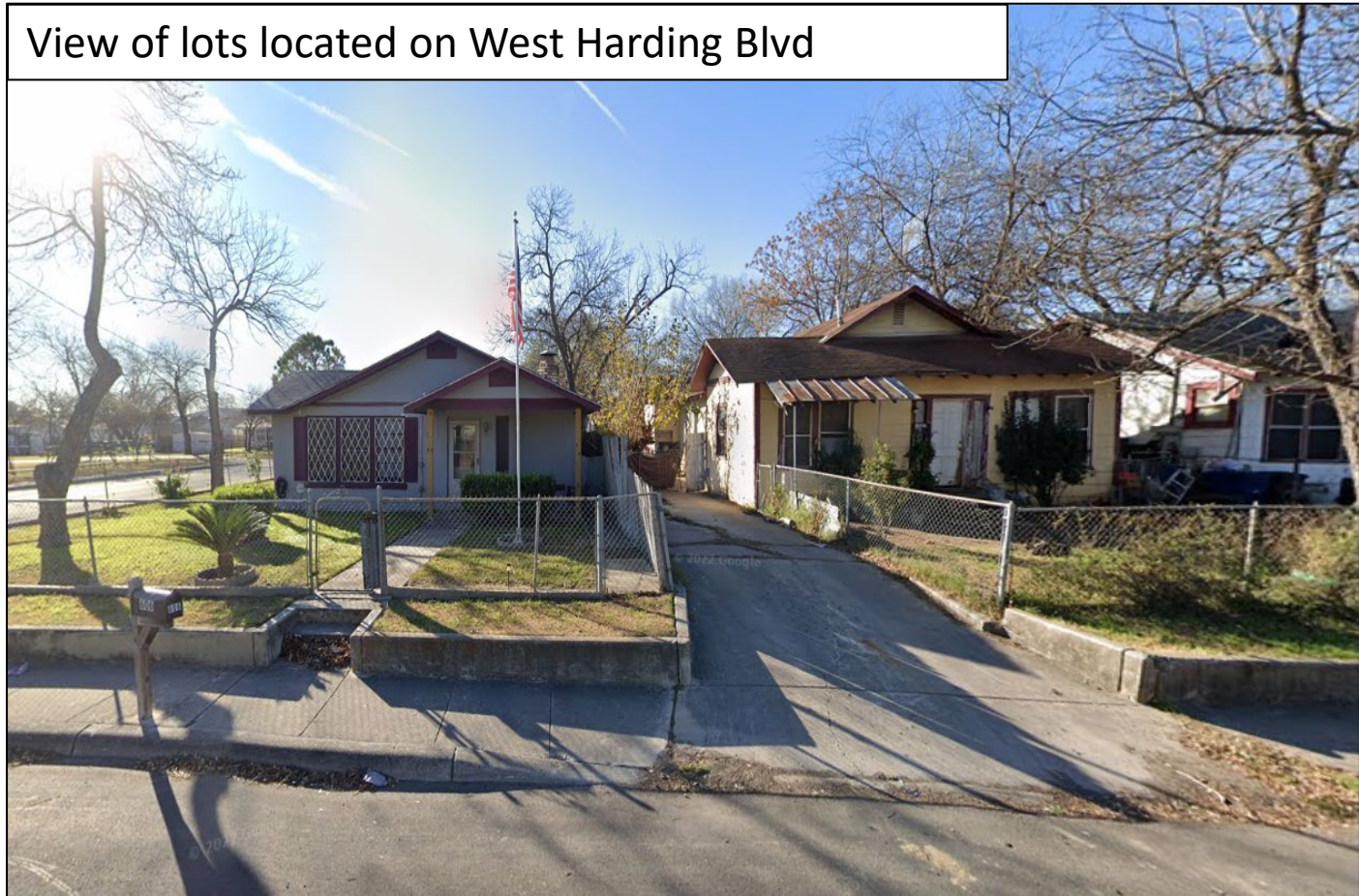
View of lots located on West Harding Blvd