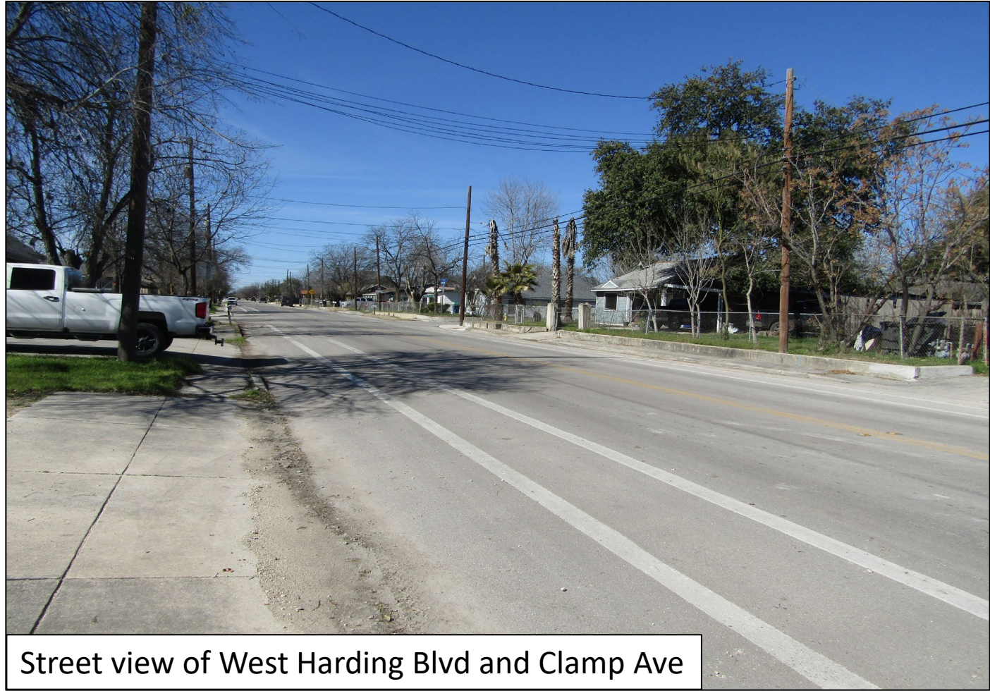
Street view of West Harding Blvd and Clamp Ave