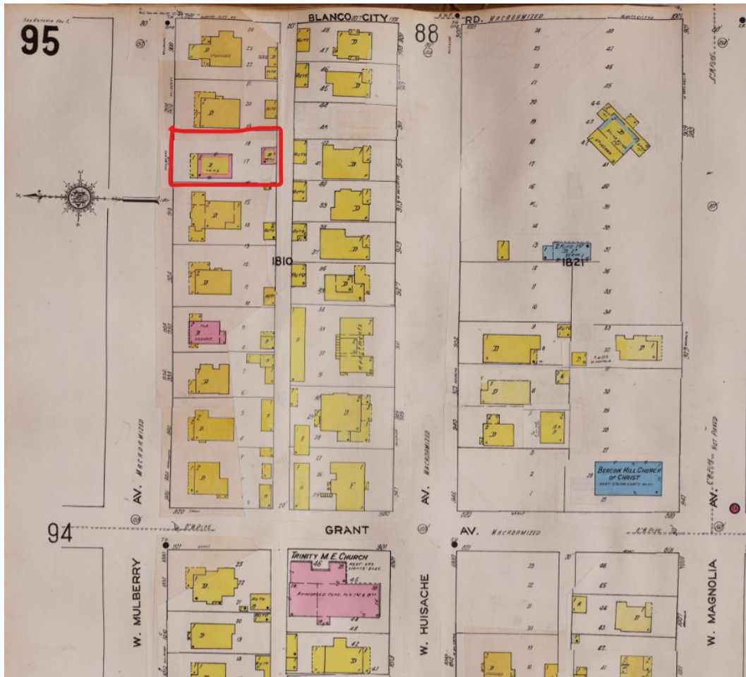
6. Sanborn Map (1931), Vol.1, Sheet 95

100 W. HOUSTON ST., SAN ANTONIO, TEXAS 78205