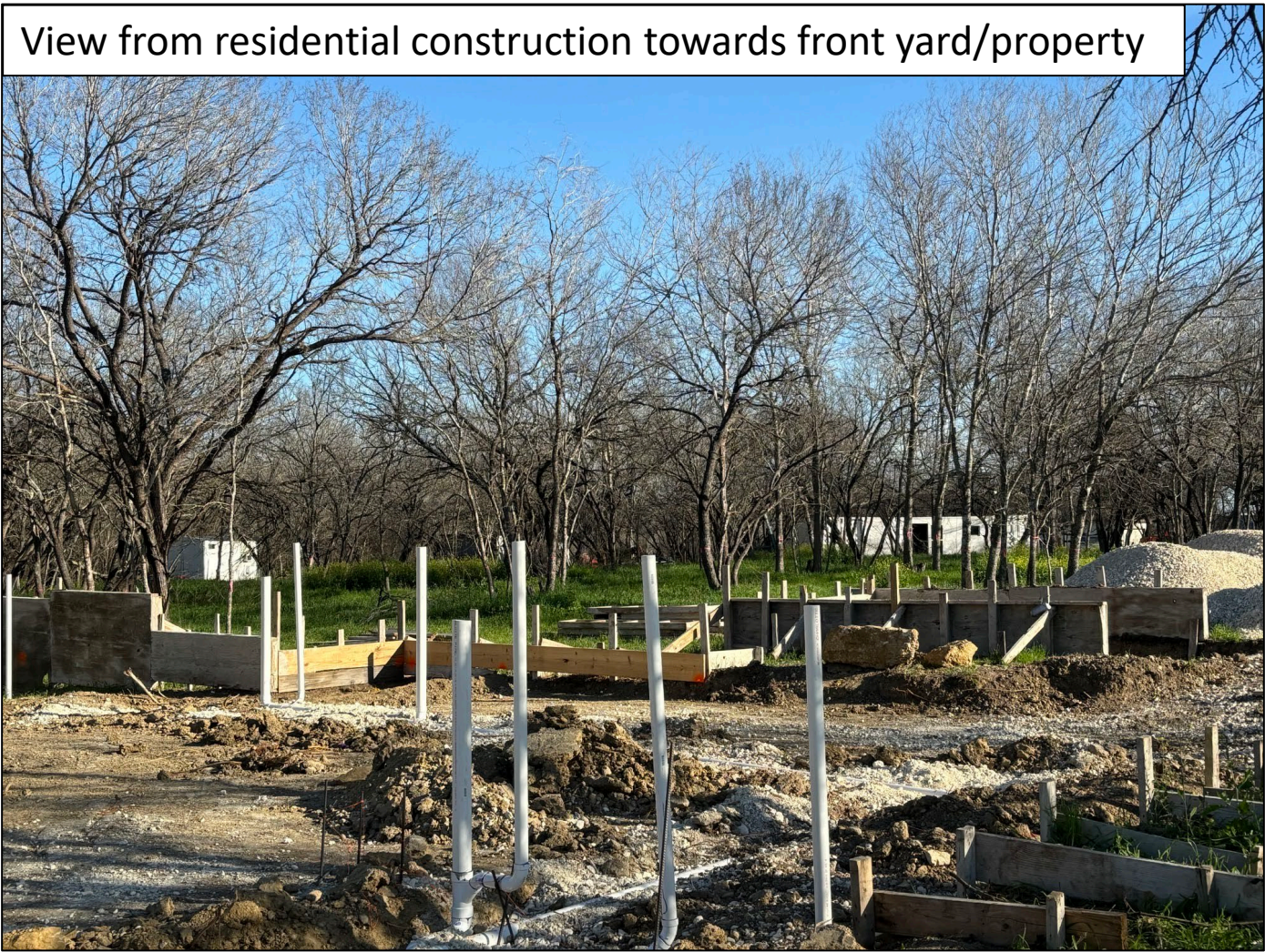
View from residential construction towards front yard/property