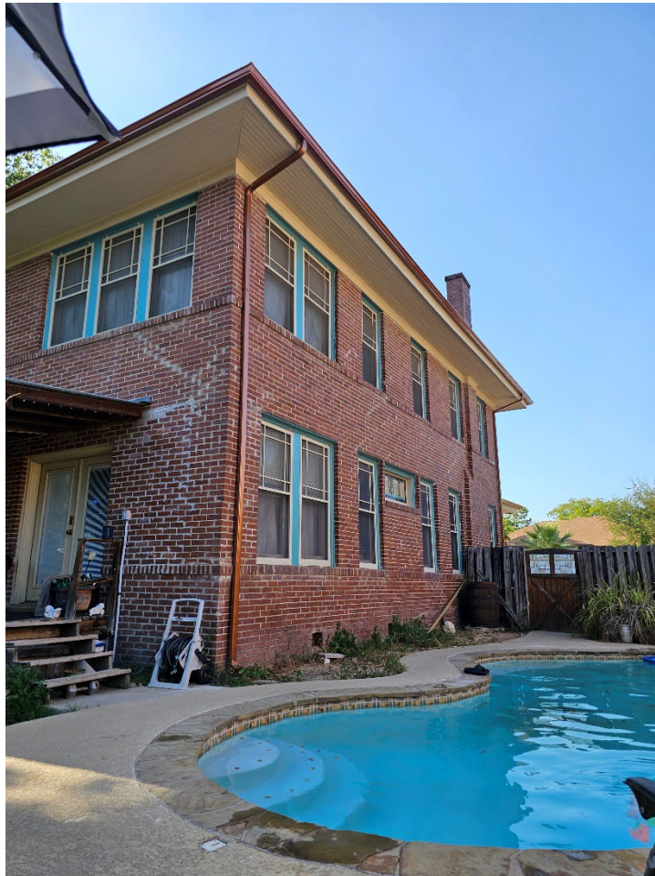
3. 914 West Mulberry Avenue – Left side (East)

100 W. HOUSTON ST., SAN ANTONIO, TEXAS 78205