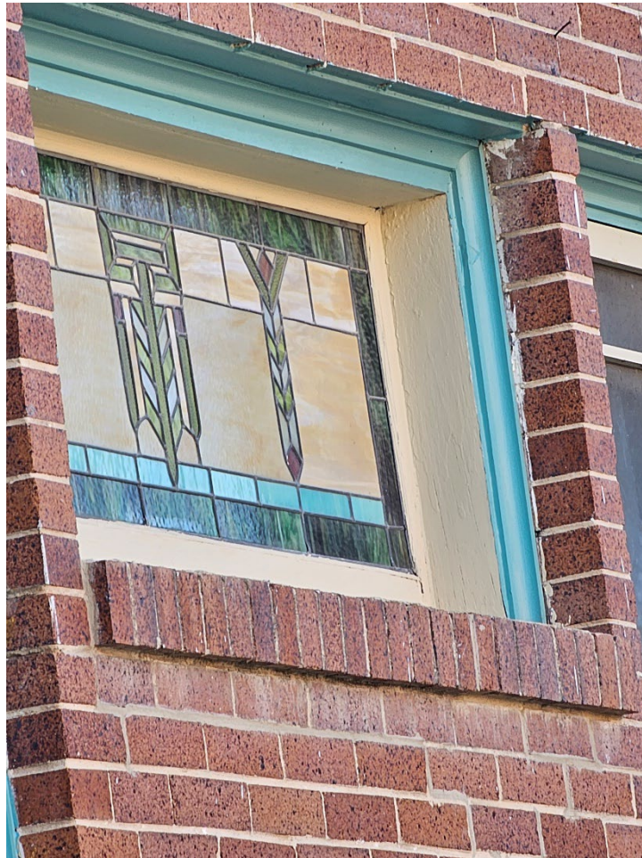
5. 914 West Mulberry Avenue – window detail

100 W. HOUSTON ST., SAN ANTONIO, TEXAS 78205