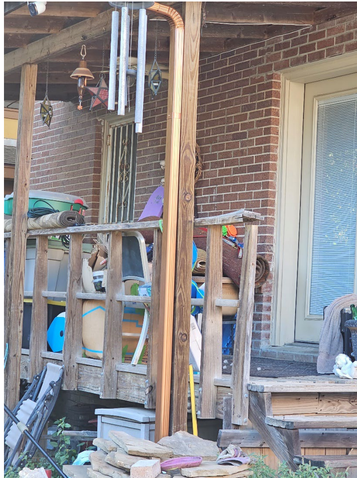
4. 914 West Mulberry Avenue – Rear (South)

100 W. HOUSTON ST., SAN ANTONIO, TEXAS 78205