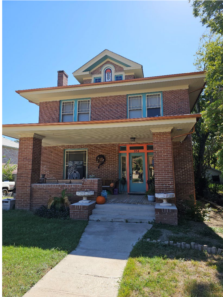
1. 914 West Mulberry Avenue – Front façade

100 W. HOUSTON ST., SAN ANTONIO, TEXAS 78205