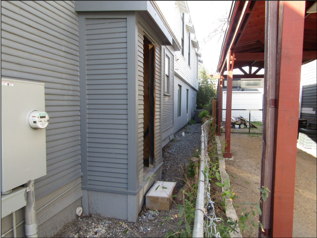
Views of subject property