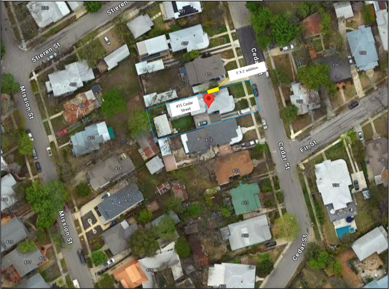
Aerial Image of Subject Property