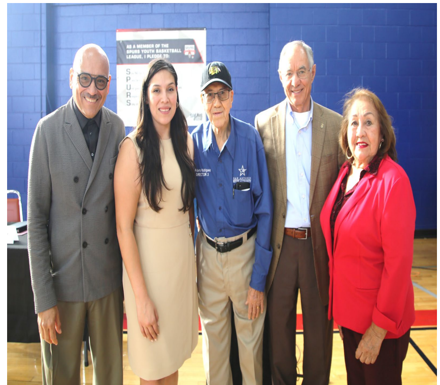
Westside Creeks Oversight Committee