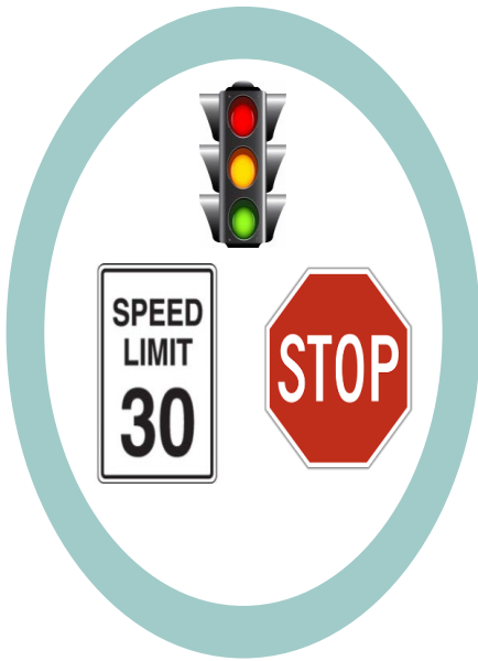
Traffic Control Devices Type & Location