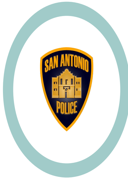
All Devices Listed for Enforcement