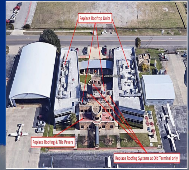
Terminal Roof Replacement