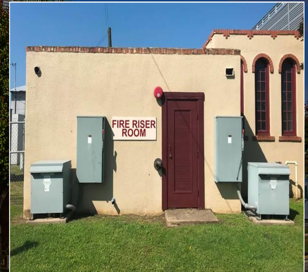
Generator Building Reconstruction