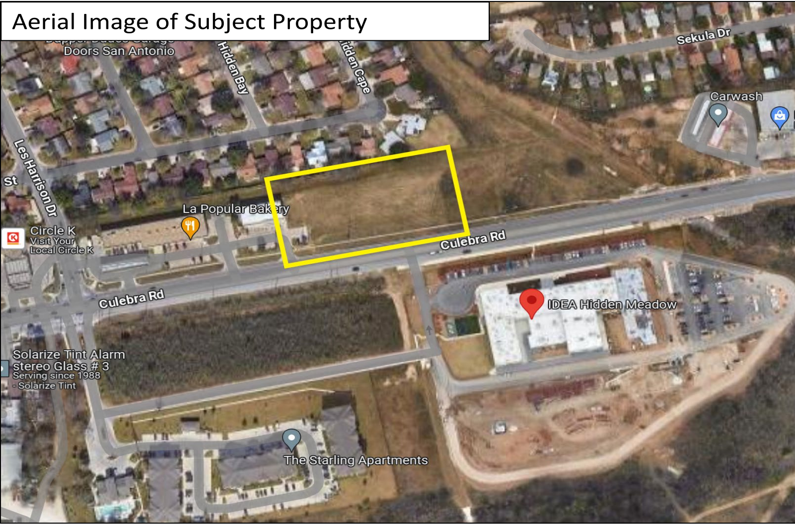
Aerial Image of Subject Property