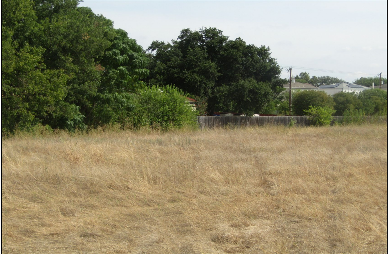
Views of subject property