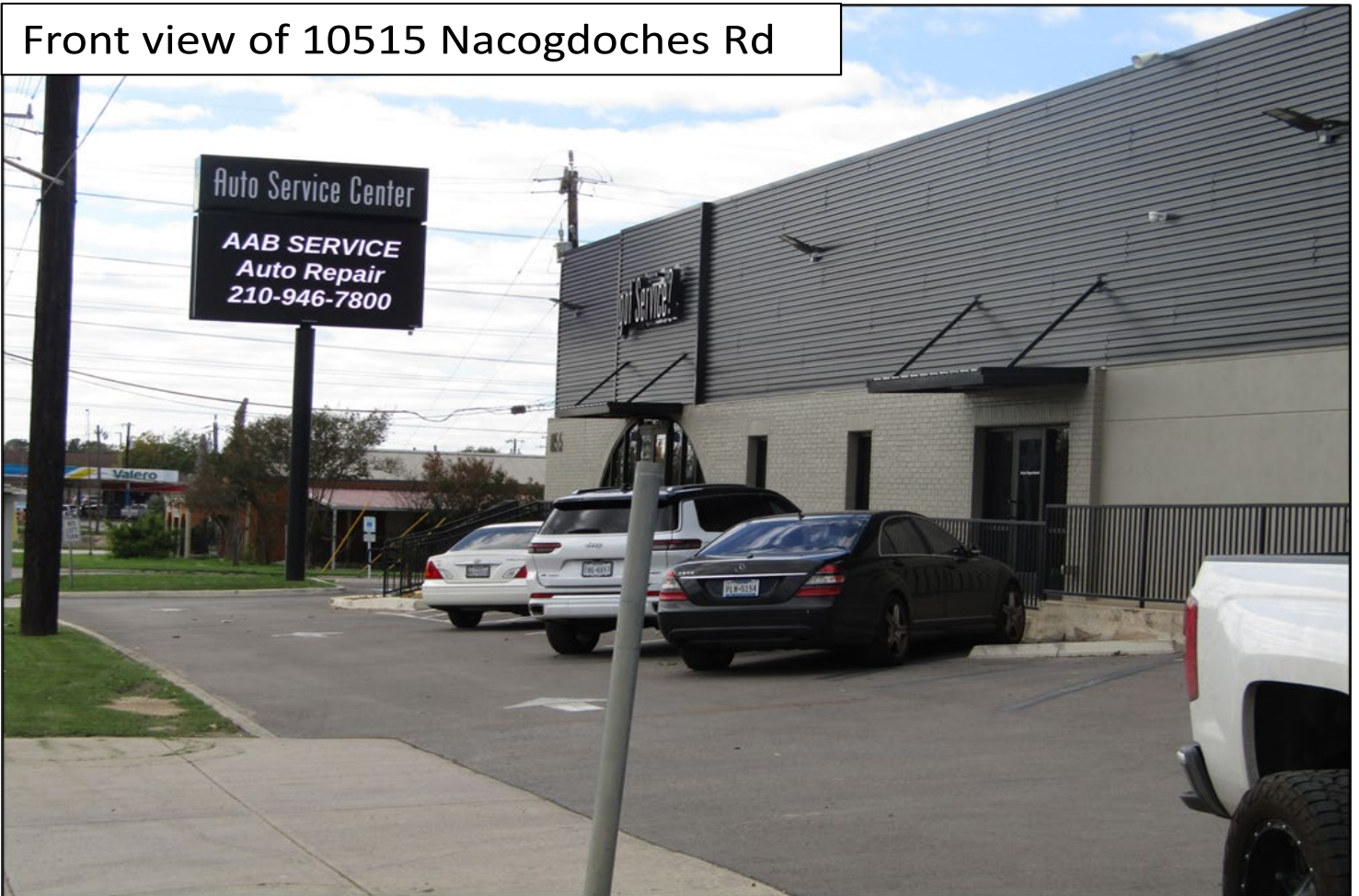
Front view of 10515 Nacogdoches Rd

Located on the corner of Starcrest Drive and Nacogdoches Road