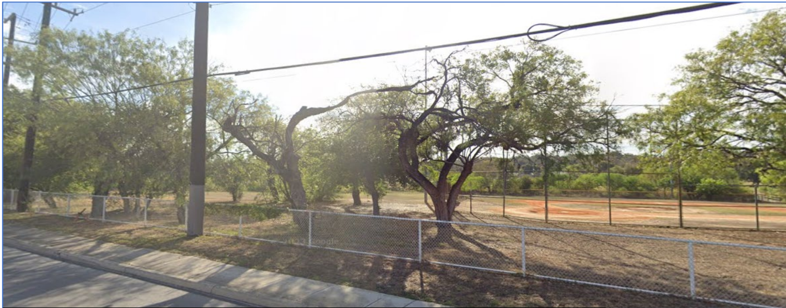
Across the street: Lady Bird Johnson Park