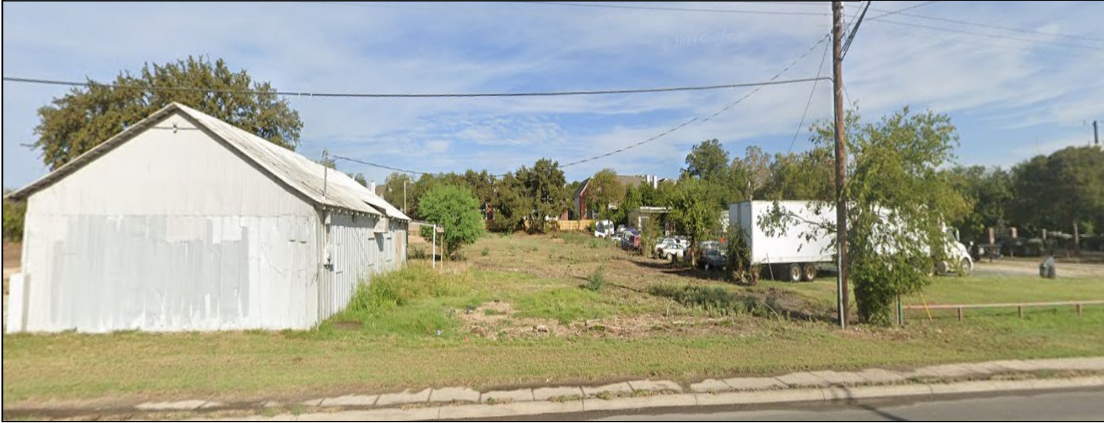
Views east of the property