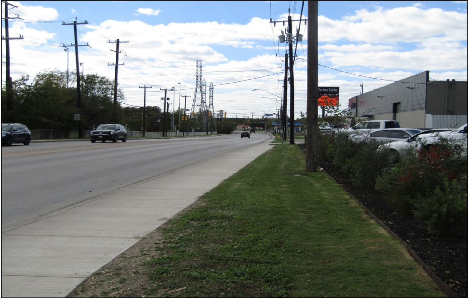
View towards west of property