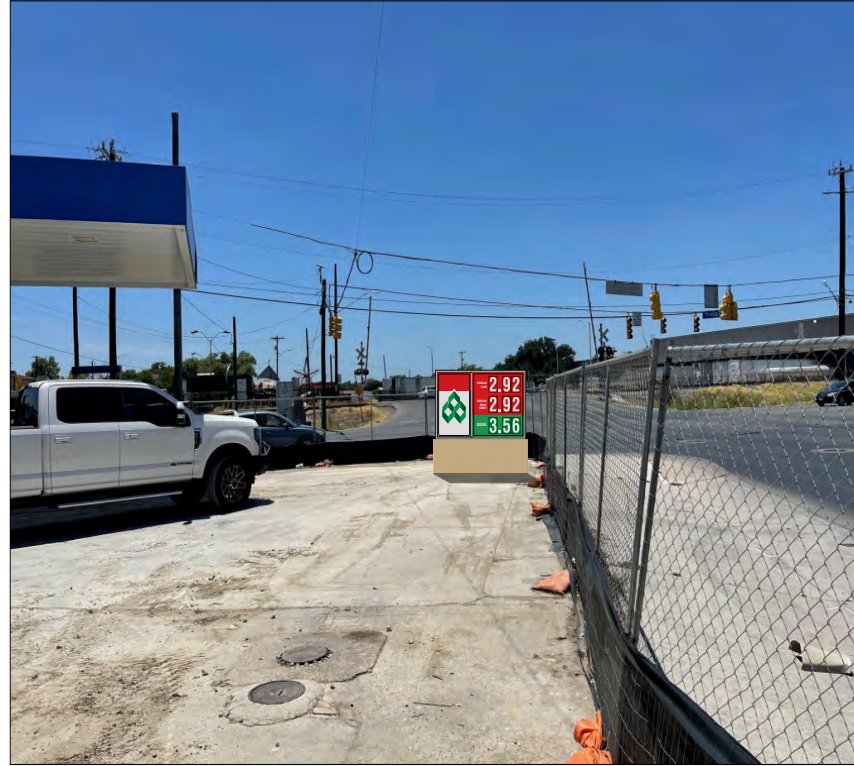
Photo Survey - Proposed