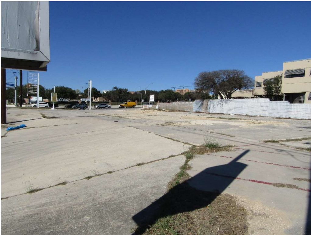
Right Side of Subject Property