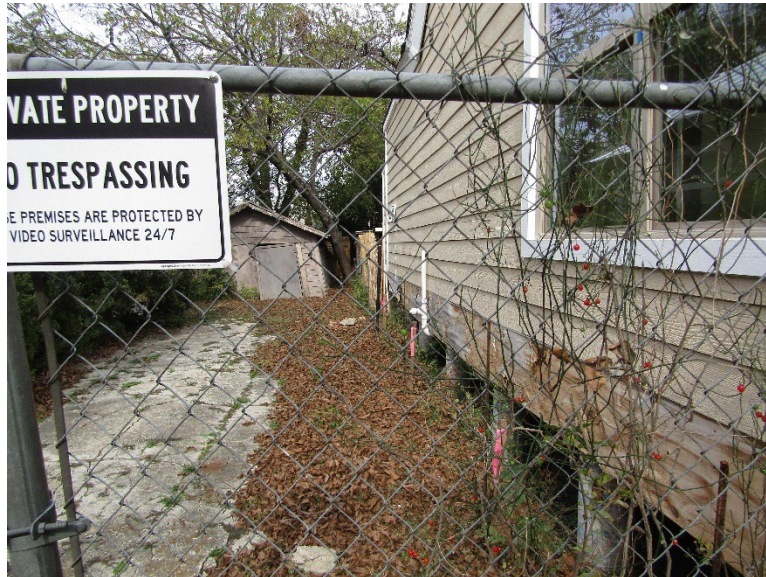
Side of Property