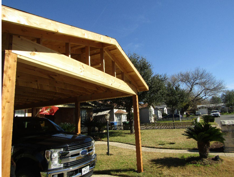
Carport/ No Gutters