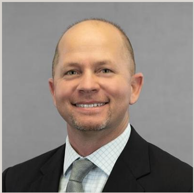
Mentor: SpawGlass Civil Construction, Inc.