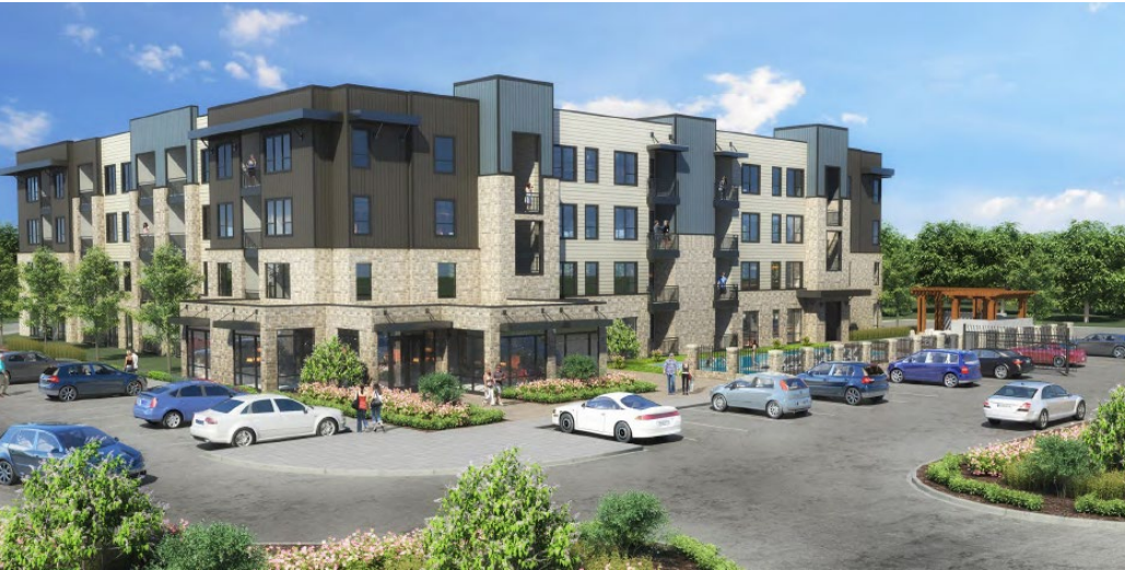
Vista at Everest, Atlantic Pacific Companies (2020 9% HTC recipient)