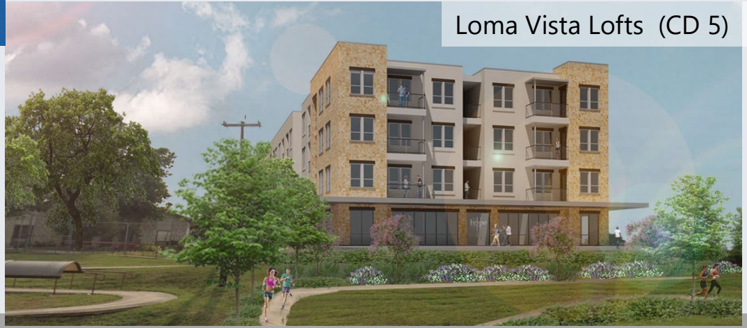
Loma Vista Lofts (CD 5)