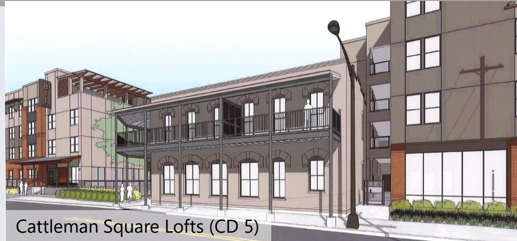
Cattleman Square Lofts (CD 5)