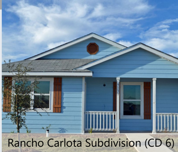
Rancho Carlota Subdivision (CD 6)