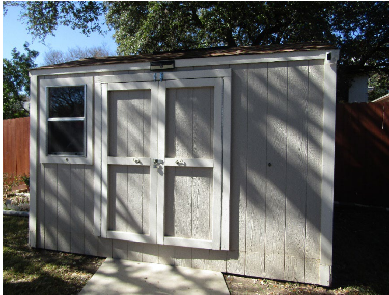
Detached Structure Measurement