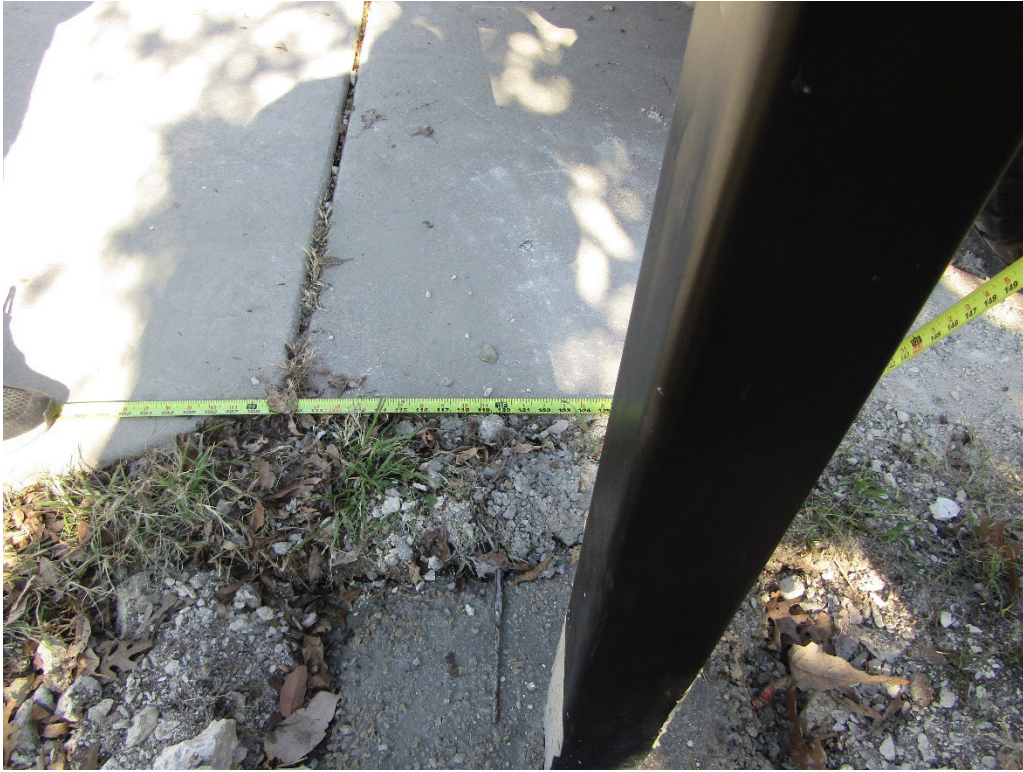
Left Post to Carport