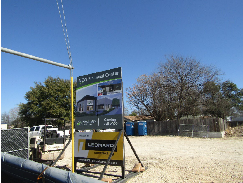
Side of Subject Property

Subject Property: 3200 Fredericksburg Road