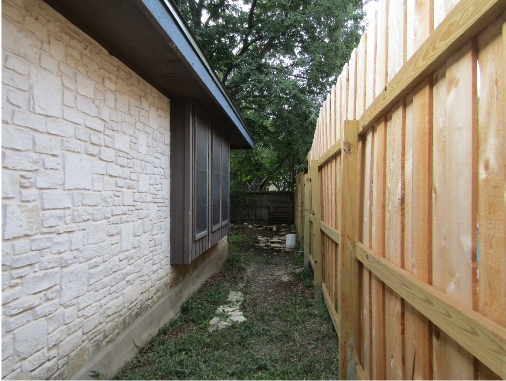
Rear Yard of Subject Property