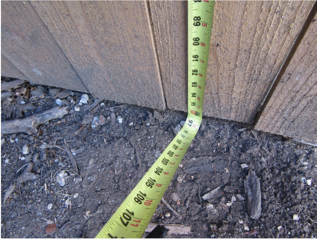
8' Solid Screened Fence