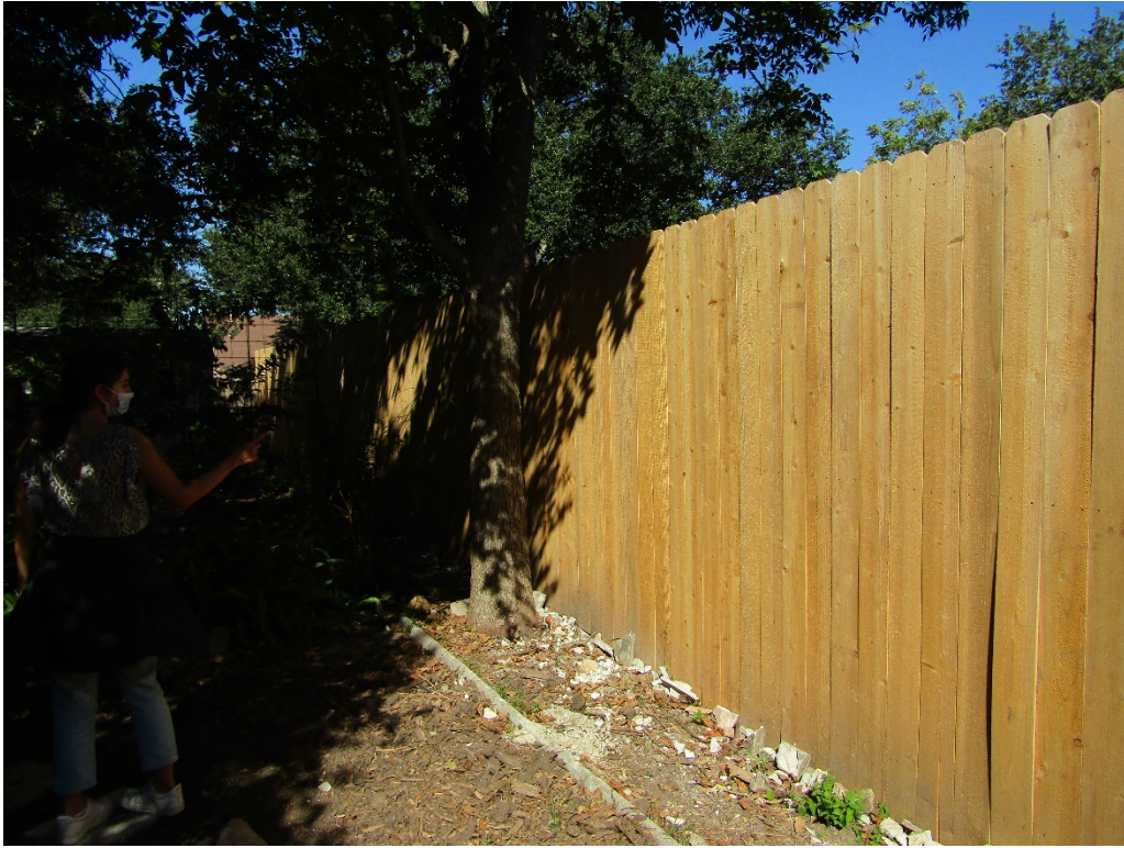
Rear Yard of Subject Property