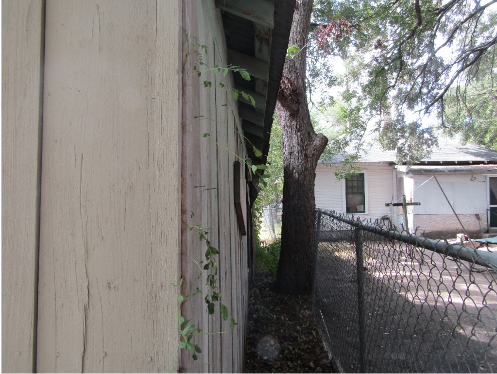
2' 2" from Side Property Line