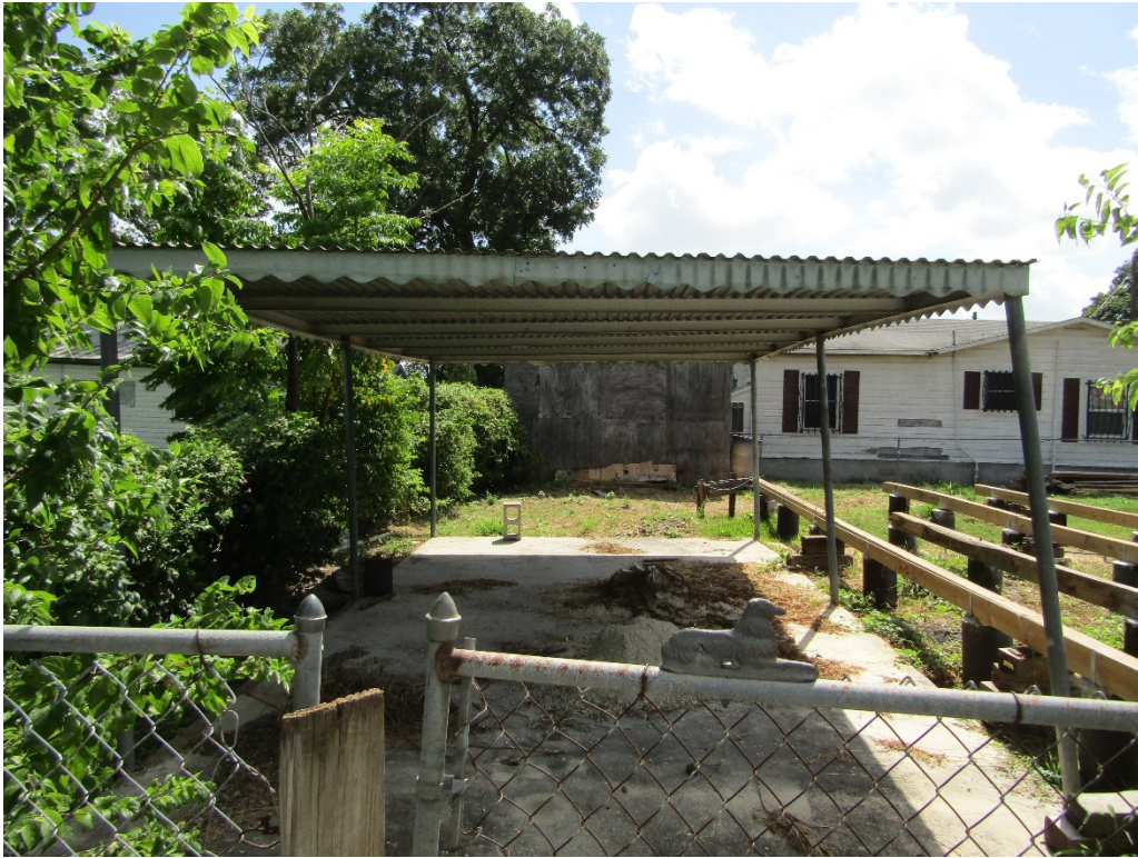
15' 5" from Rear Property Line