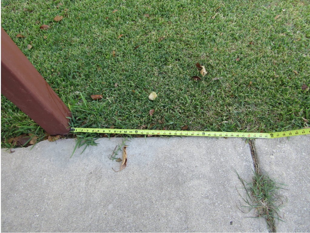
Carport Length: 23 feet