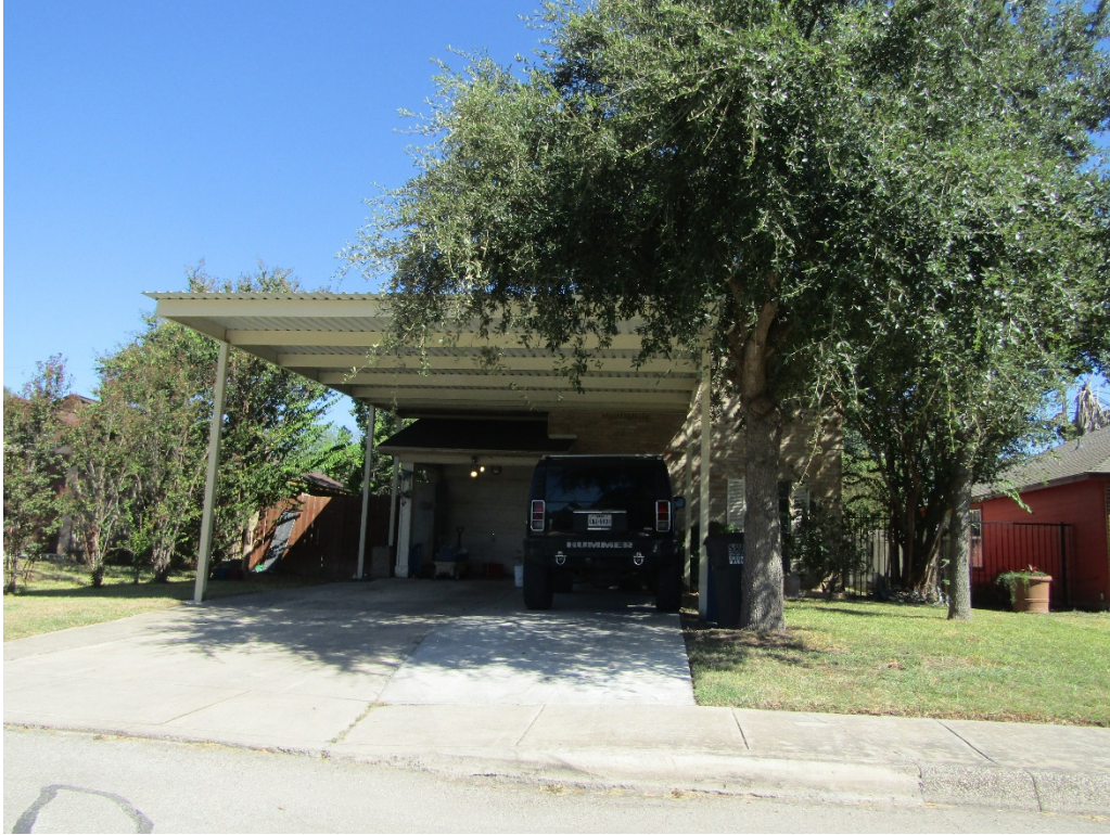
Similar Carport in Surrounding Area