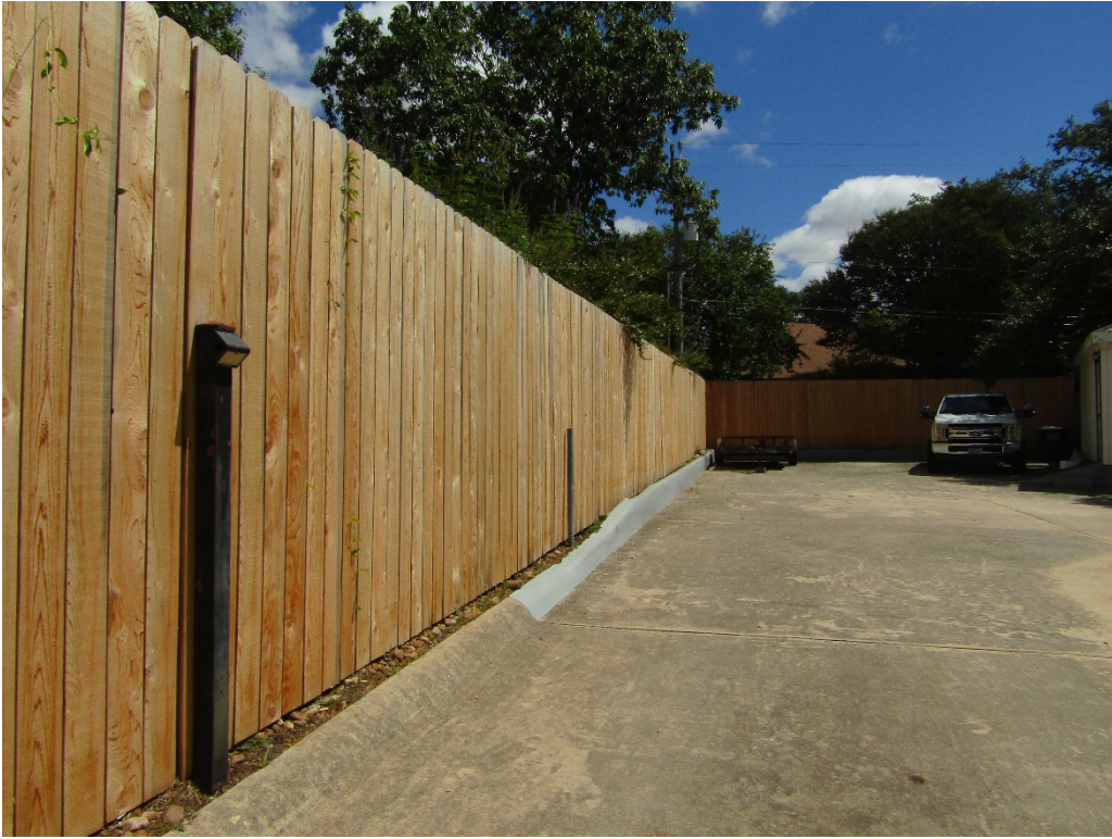
8 Foot Fence