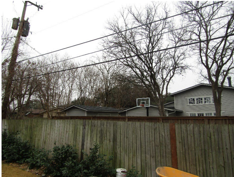
Neighbor with Detached Structure