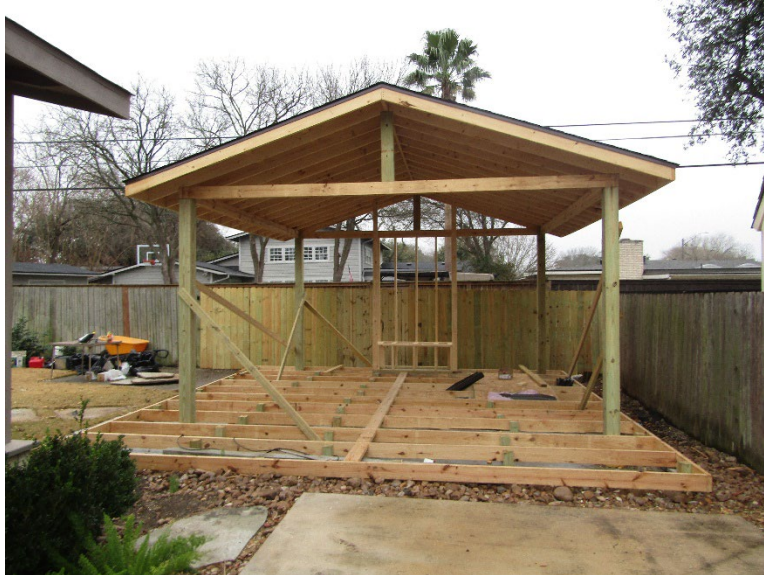
Rear of Detached Structure