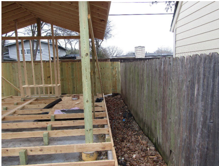
Drainage Pipe of Detached Structure