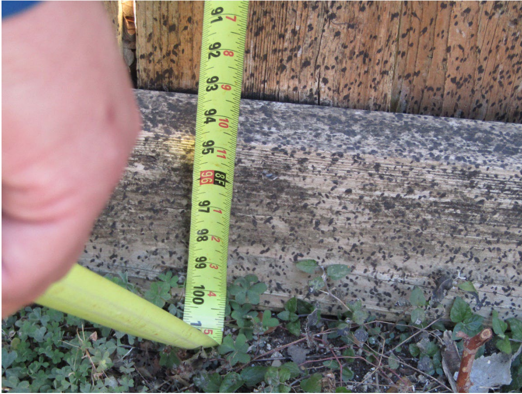
Side Fence / Elevation Change