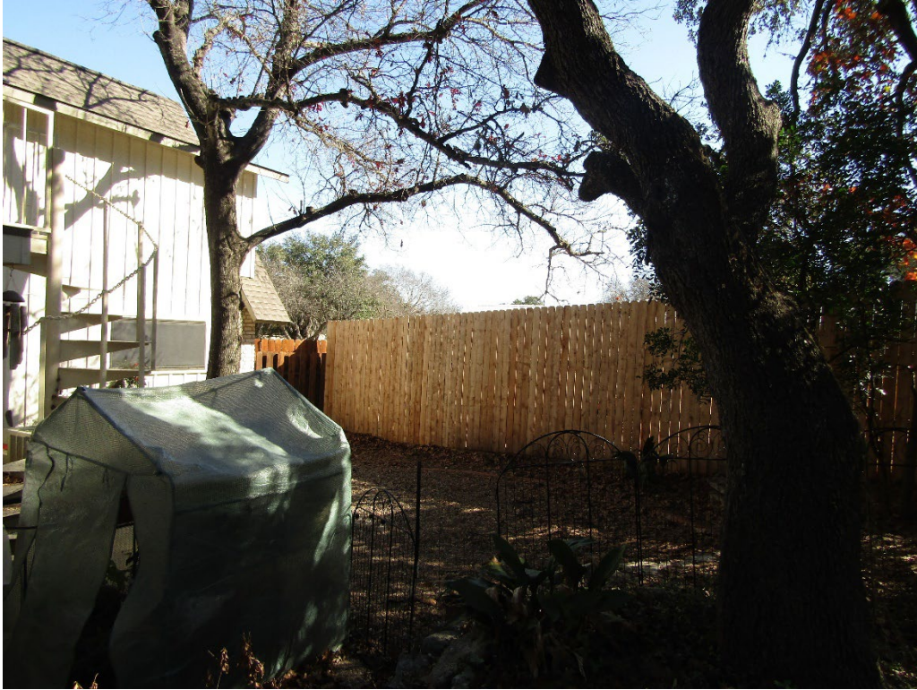
Rear Property Fence