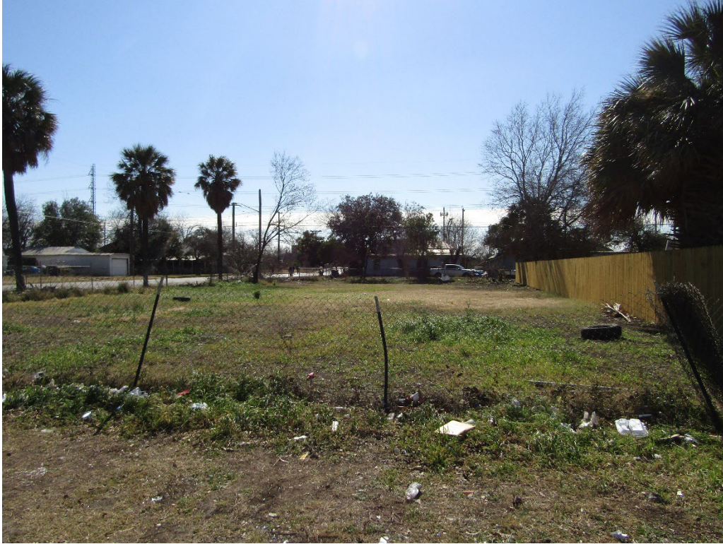
Bar Across Street