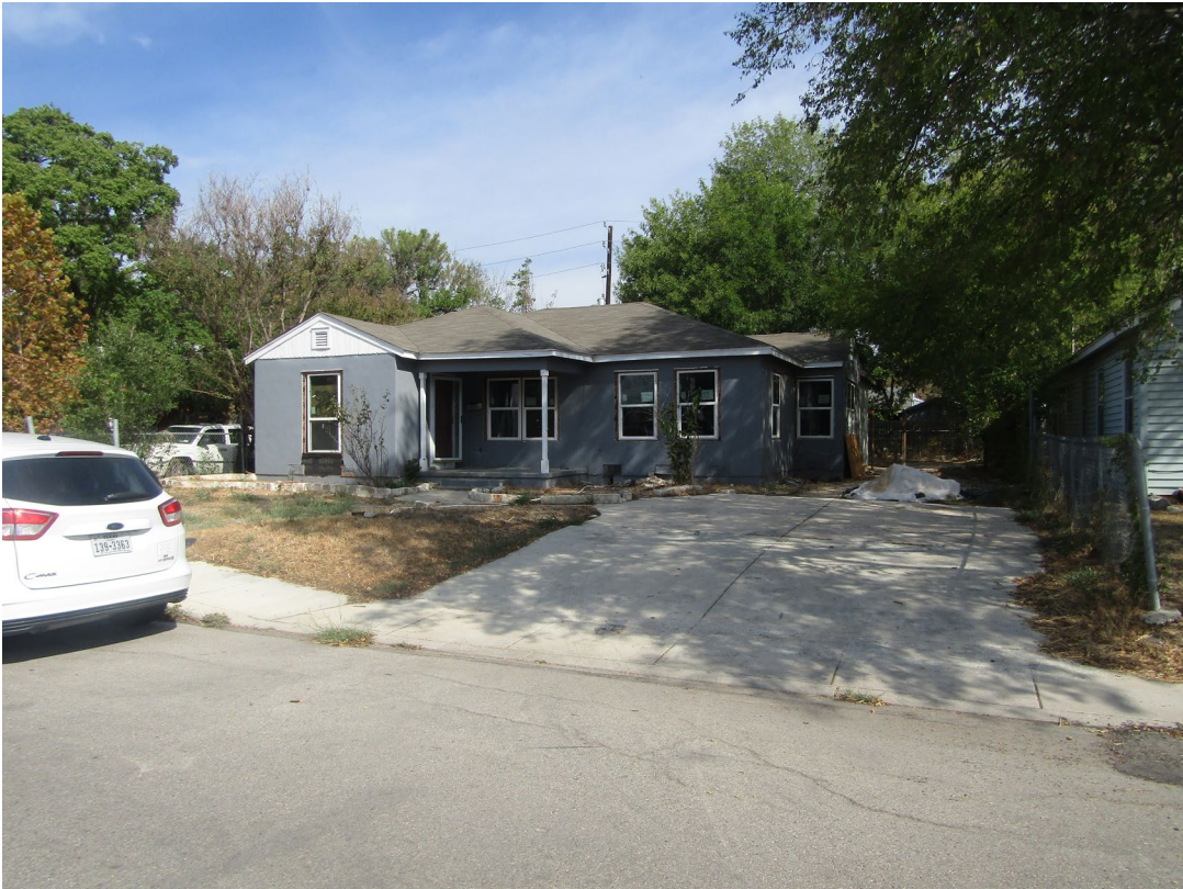
Roof Addition (On the Right)