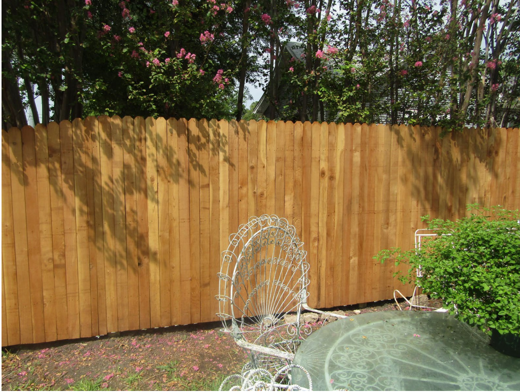
Alternate View of Fence