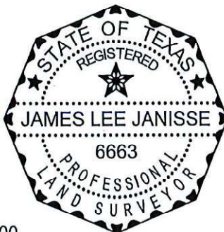
EXHIBIT OF A 16.371 ACRE TRACT