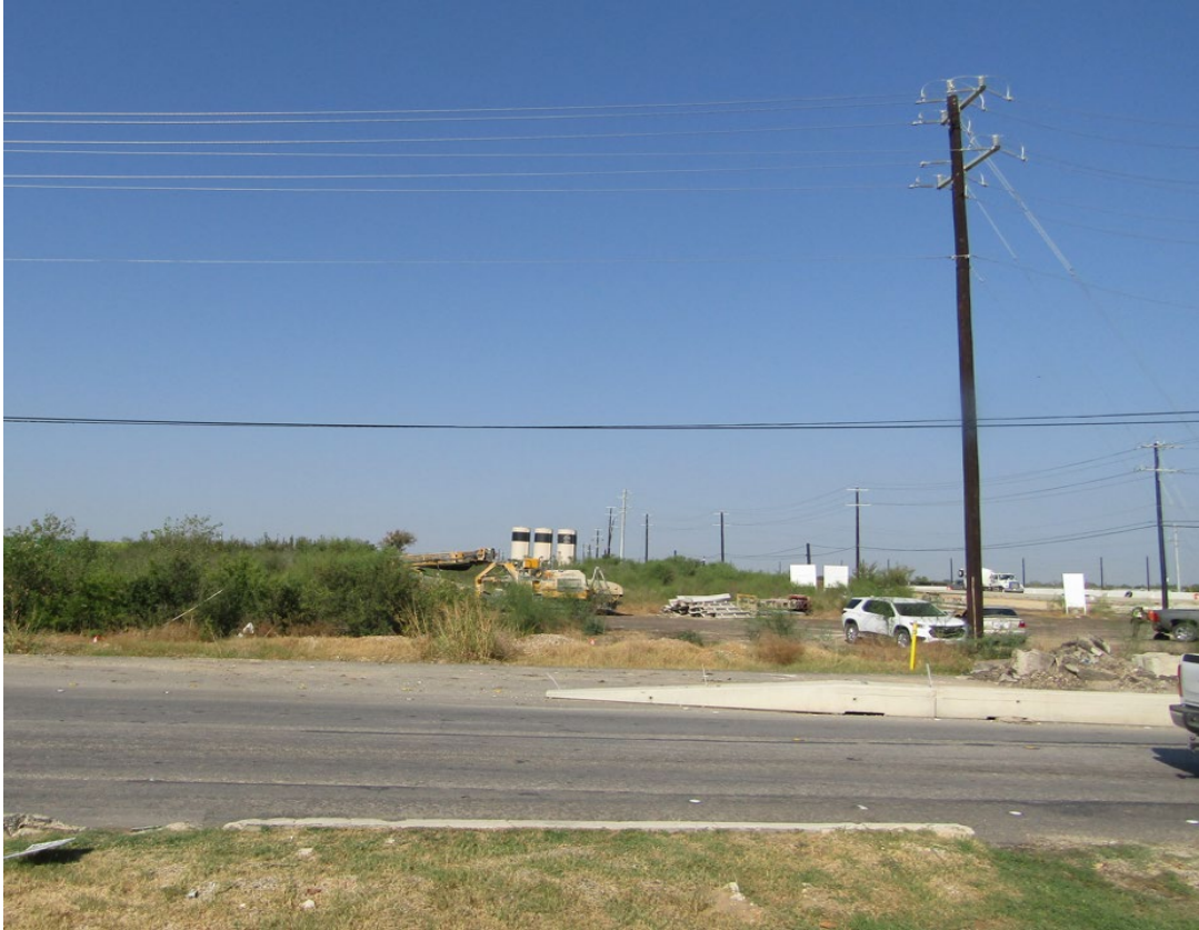
Sign Across The Street