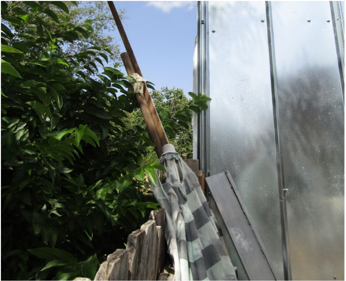
Rear Lot Coverage