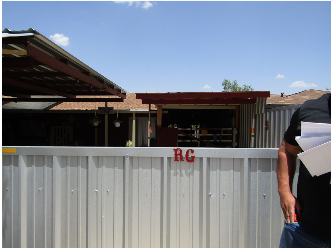
Carport Front Setback and Overhang