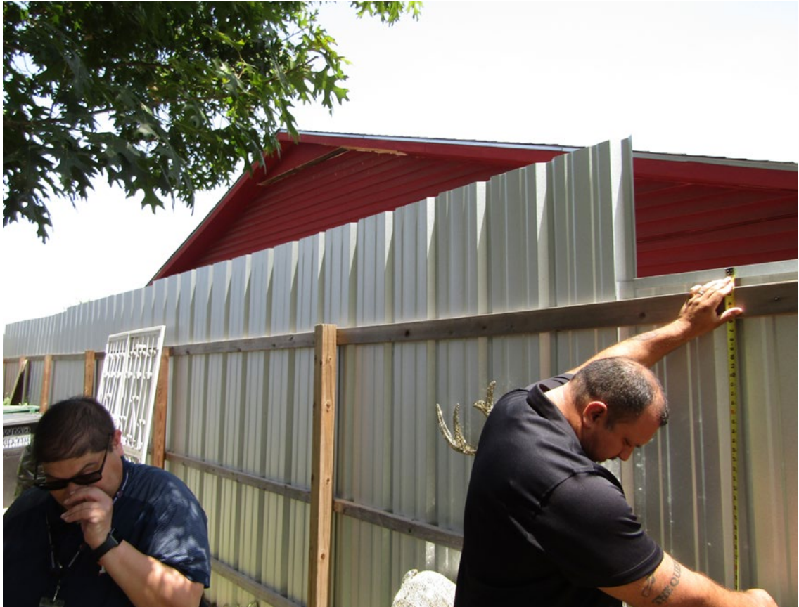
Driveway Clear Vision