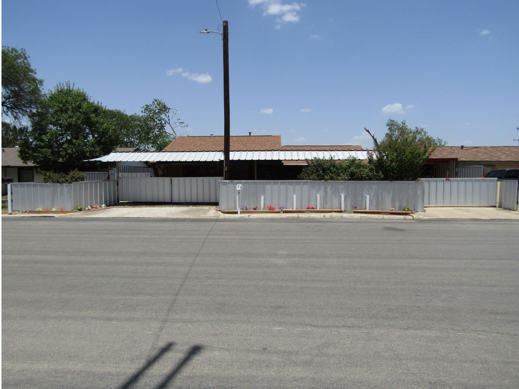
View of Fences in the Front and Side Yards