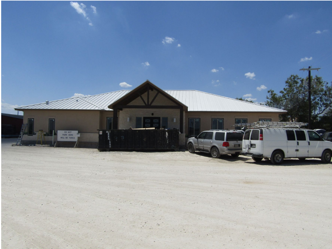
View Looking Southeast