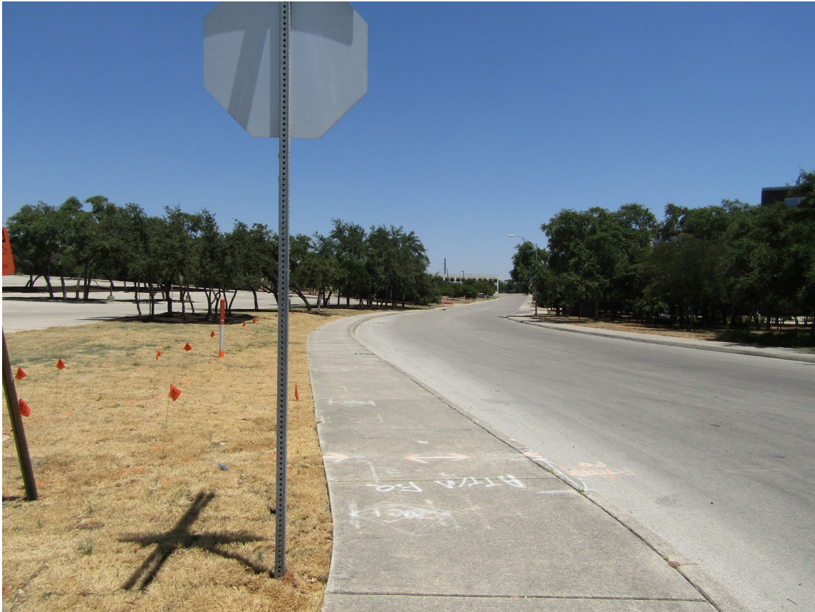
View Looking Northwest (Rogers Road Seen on the Left)