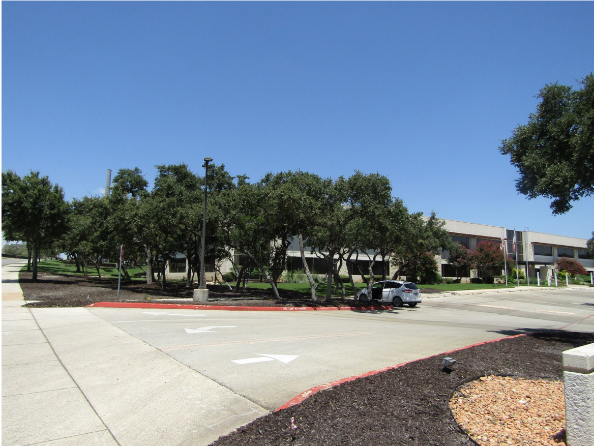
View Looking Southeast (Rogers Road on the Left)