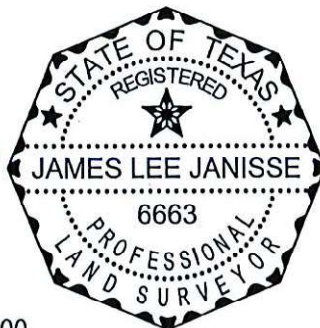
EXHIBIT OF A 16.371 ACRE TRACT