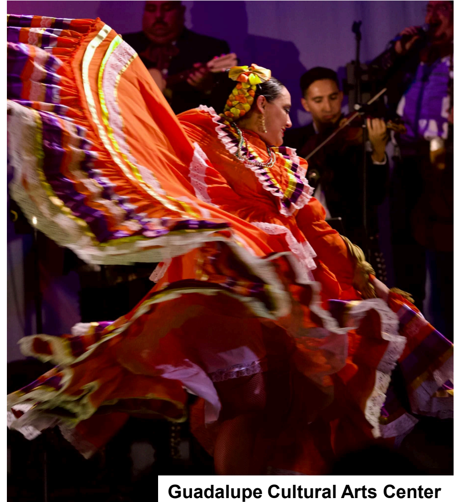
Guadalupe Cultural Arts Center