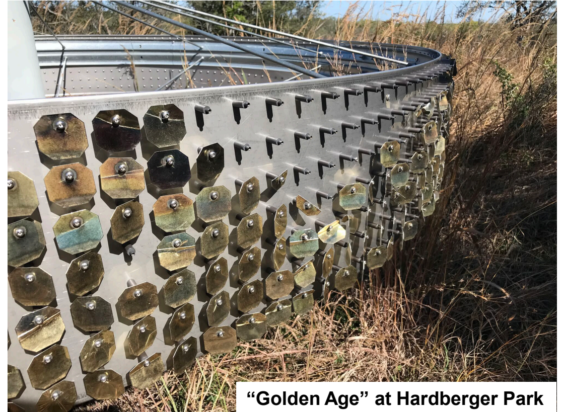
“Golden Age” at Hardberger Park