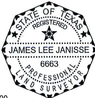
EXHIBIT OF A 16.371 ACRE TRACT