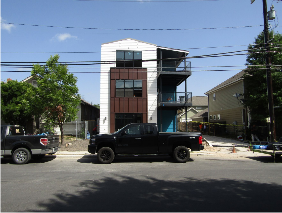
Three Stories Adjacent To Single-Family Use