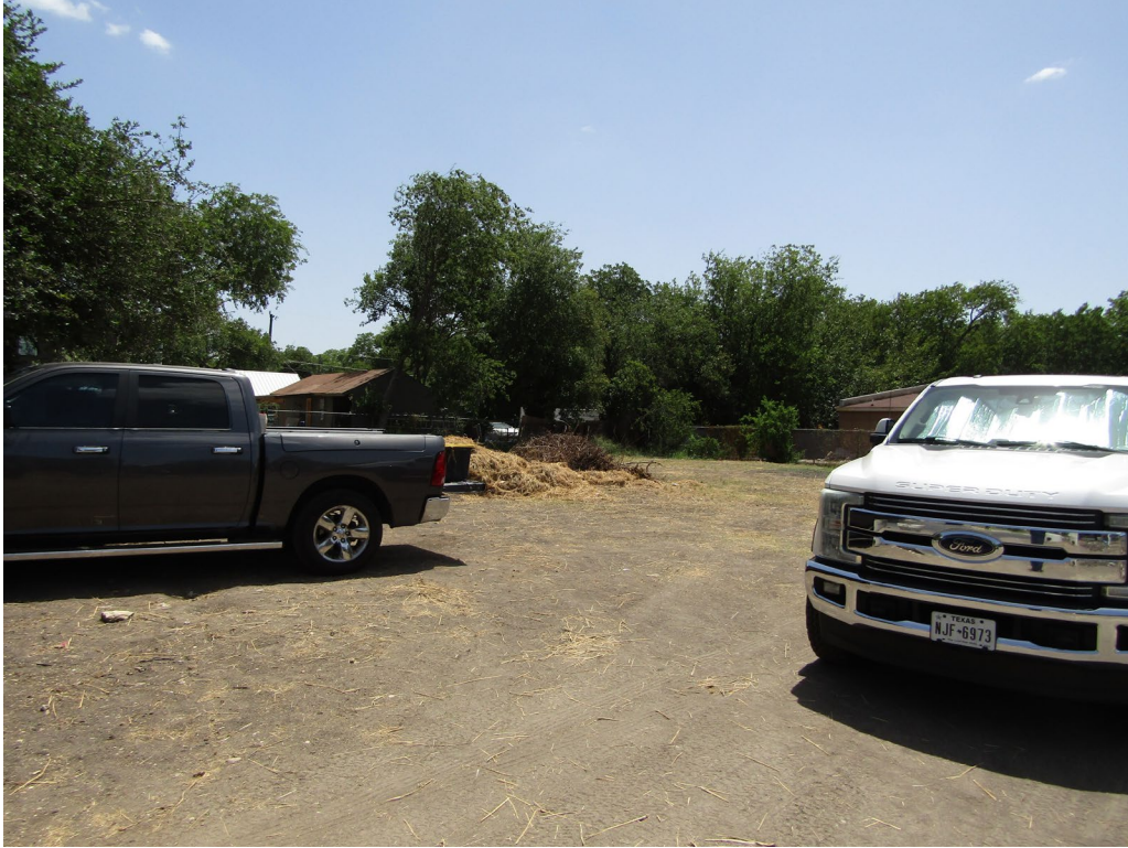
Street View of site